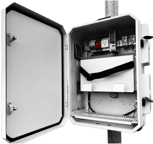
Quick Setup Pole Mounting