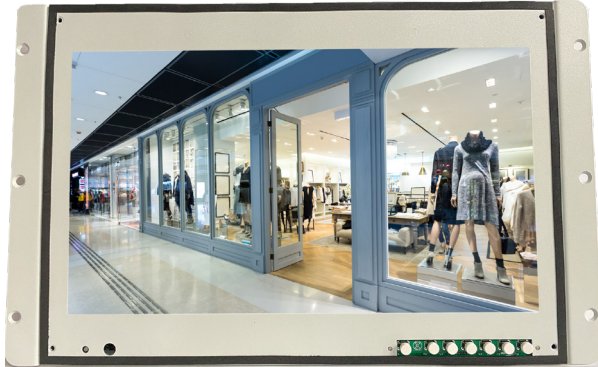
*Image above is IMHD-10FLUSH with mounting ears