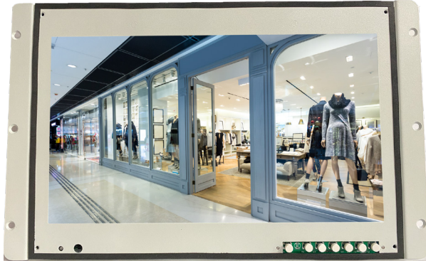
*Image above is IMHD-10FLUSH2 with mounting ears