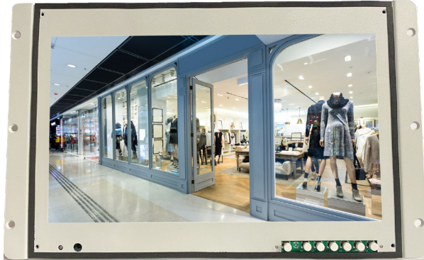
*Image above is IMHD-10FLUSH2A with mounting ears