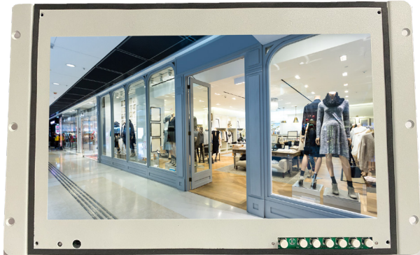
*Image above is IMHD-15FLUSH2 with mounting ears