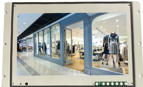
*Image above is IMHD-15FLUSH2A with mounting ears