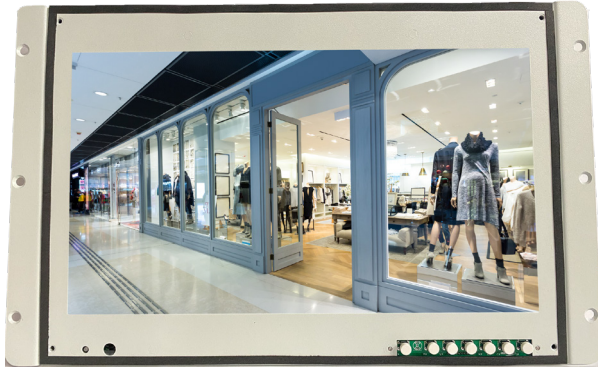
*Image above is IMHD-19FLUSH2 with mounting ears