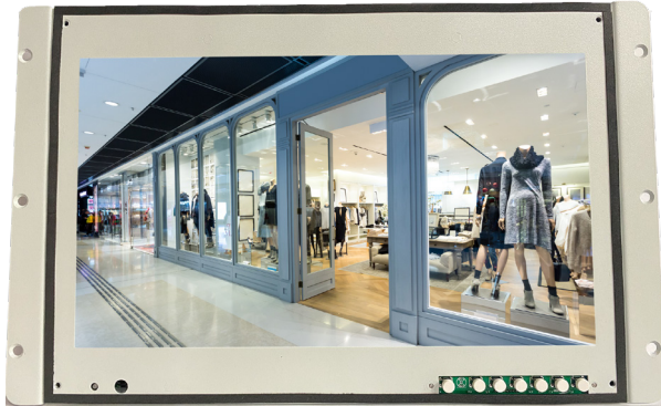
*Image above is IMHD-19FLUSH2A with mounting ears