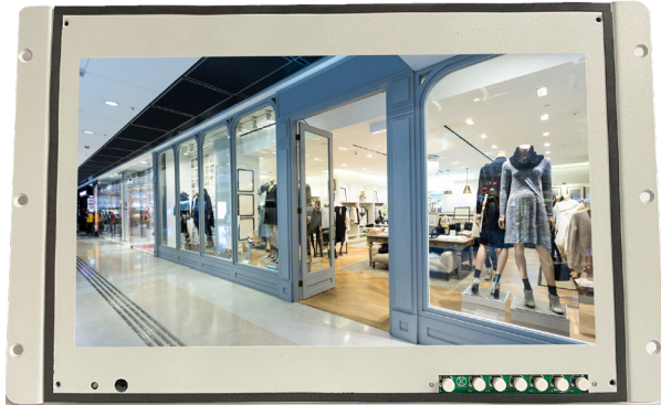
*Image above is IMHD-22FLUSH2 with mounting ears