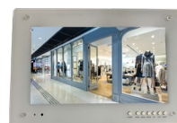
IMHD-10/15/19/22FLUSH2 10/15/19/22" 1920 x 1080 Flush Case Monitor

Flush mount monitors offer a sleek, modern look by sitting level with the installation surface, seamlessly integrating into walls, desks, or enclosures while saving space and reducing bulk. Their design also enhances durability and safety, minimizing the risk of accidental damage or snagging in high-traffic areas.