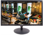
IMHD-24HVB IMHD-24HVBN 24" Full HD 1920 x 1080 LED Monitor HDMI 2.0, VGA, Looping BNC Inputs & Outputs