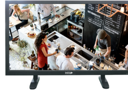
IMHD4K-65N 65" Industrial 4K Metal Case Monitor 3840 x 2160, HDMI, DVI, VGA, Built-In Speaker