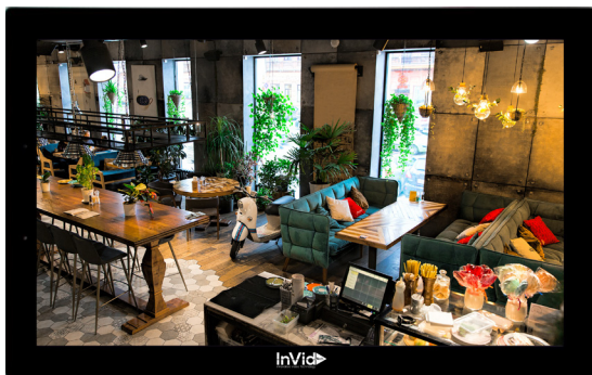
IMHD-32OVM 32" metal waterproof and vandal-proof monitor

OVM Outdoor Vandal Series Monitors: Designed for 24/7 Operation, 1920 x 1080, 300cd, IK10 Vandal Resistant, IP67 Weatherproof, 5ms (no ghosting!), HDMI 2.0, VGA, Built-in Speaker