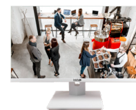
IMHD-27HDF 27" Frameless Plastic Case LED Monitor 1920 x 1080, HDMI 2.0, DP