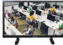
IMHD4K-50VANDALOD IMHD4K-65VANDALOD 50/65" 3840 x 2160 4K Monitor Weather Resistant Vandal-Proof Monitor