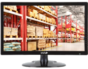
IMHD-24HDLOOP 24" Full HD 1920 x 1080 LED Monitor, HDMI, VGA, BNC HD Inputs (TVI/AHD/CVI) BNC Loop Out