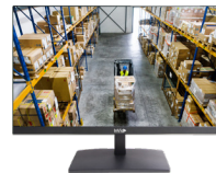
IMHD-22HVF 22" Frameless Plastic Case LED Monitor 1920 x 1080 LED, HDMI 2.0, VGA

Frameless monitors provide a clean and minimalist design that enhances the visual appeal of a workspace or gaming setup. Their thin bezels make the screen look larger and more immersive.