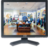
IMHD-17AN 17" HD 1280 x 1024 LED Monitor, HDMI, VGA, Looping BNC Inputs