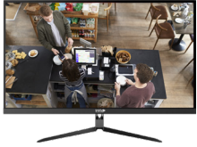
IMHD4K-32A 32" Ultra High Definition 4K Monitor 3840 x 2160 Image, HDMI, DisplayPort