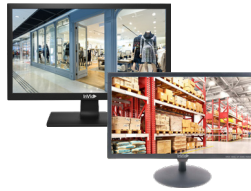
IMHD-20HVB IMHD-22HVB IMHD-22HVBN 20/22" Full HD 1920 x 1080 LED Monitor HDMI, VGA, Looping BNC Inputs & Outputs