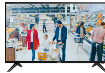
IMHD-32HDLOOP 32" Full HD 1920 x 1080 LED Monitor, HDMI, VGA, BNC HD Inputs (TVI/AHD/CVI) BNC Loop Out