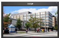
IMHD-32PVM2HDMI 32" 1080P IP PVM Metal Case Monitor (2) HDMI, (1) VGA, BNC Input, BNC Output