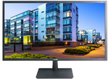
IMHD4K-28 28" Ultra High Definition 4K Monitor 3840 x 2160 Monitor HDMI, DisplayPort

A 4K resolution monitor provides ultra-high-definition clarity, enabling users to see critical details like faces and license plates with exceptional precision. It allows better digital zooming without pixelation and can display multiple camera feeds in full detail simultaneously. This future-proof technology enhances efficiency in monitoring and ensures high-quality evidence for investigations or legal proceedings.