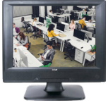
IMHD-10N 10" HD 800 x 600 LED Monitor, HDMI, VGA, Looping BNC Inputs

A monitor with a BNC port is a valuable asset for the security and surveillance industry due to its versatility and reliability. It allows seamless integration with analog CCTV cameras and DVRs, ensuring compatibility with legacy systems while delivering high-quality video with minimal signal loss or interference, even over long distances. The plug-and-twist design ensures quick, secure setup, and the low-latency direct video feed supports real-time monitoring. Additionally, BNC ports are ideal for hybrid setups, enabling analog cameras to function alongside digital systems during upgrades. This flexibility makes a BNC port a great option for effective surveillance operations.