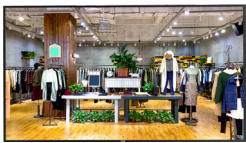
IMHD4K-43N IMHD4K-55N 43/55" Ultra High Definition 4K Monitor 3840 x 2160 Image, HDMI, VGA, DisplayPort