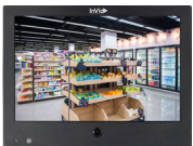
IMHD-7PVM 7" HD Analog PVM Monitor (2) HDMI, VGA, RJ 45 PoE Input, BNC Output, 5 MP Built-in Camera, PoE+

Public View Monitors (PVMs) with integrated security cameras serve as a powerful deterrent to theft and misconduct by displaying live surveillance footage, reminding individuals they are being monitored. They are ideal for retail stores, entryways, and high-traffic areas where visible security measures can reduce shrinkage and improve safety. Additionally, PVMs enhance customer trust by demonstrating a commitment to security and transparency in public or commercial spaces.