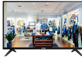
IMHD-32HVB 32" 1920 x 1080 Monitor, HDMI 2.0, VGA Input, Looping BNC Inputs & Outputs