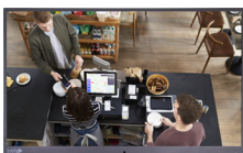
IMHD-43PVMMULTI 43" 1080P Metal PVM (2) HDMI, VGA, Built-in Camera with Motion Detection

Additional PVM Sizes Available Upon Request